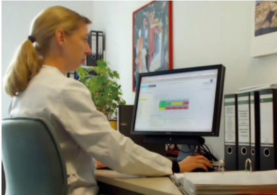
Easy data entry with RDE-LIGHT

RDE-LIGHT is an electronic data entry and data management system for clinical studies and other projects in clinical research. Data are collected without paper directly on site via an internet browser.